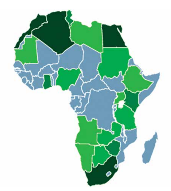
Fig. 1. Brachytherapy availability in Africa. Varying shades of green show the availability and density of brachytherapy units in countries where they are available. Blue color shows where there are no brachytherapy units

Cervical cancer incidence and total number of brachytherapy units vary significantly across the continent, with the former being significantly higher than the lat-